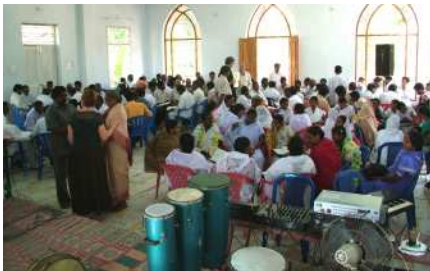
One of the annual teaching conferences in India.