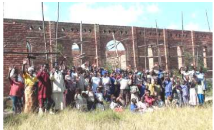
The Church at Rugandu, Diocese of Byumba

If you would like to be part of this work then please complete the form overleaf. We will then be in touch with further details.