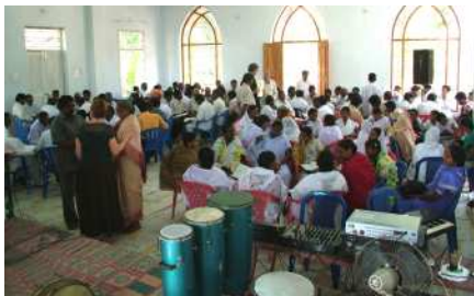
One of the annual teaching conferences