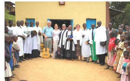
A UK team visiting a Church near Byumba

If you would like to be part of this work then please complete the form overleaf. We will then be in touch with further details.